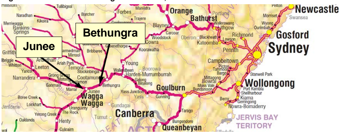
Figure 1: Location of Bethungra and Junee, NSW

At 0346 on 20 August 2013, Pacific National train 9337N left Moss Vale bound for Narrandera, NSW. Narrandera is located on the Griffith branch line that joins the Defined Interstate Rail Network at Junee<sup>1</sup> (Figure 1). The train consisted of two locomotives (8113 and 8109) hauling 15 empty wagons for a total length of 295.2 m and weight of 634.6 gross tonnes. Both locomotive drivers had over 10 years' experience in train driving, were medically fit and were assessed as competent at the time of the incident. The driver in the observer's position had 7 years route knowledge while the driver at the locomotive controls was familiarising himself with the route south of Cootamundra.