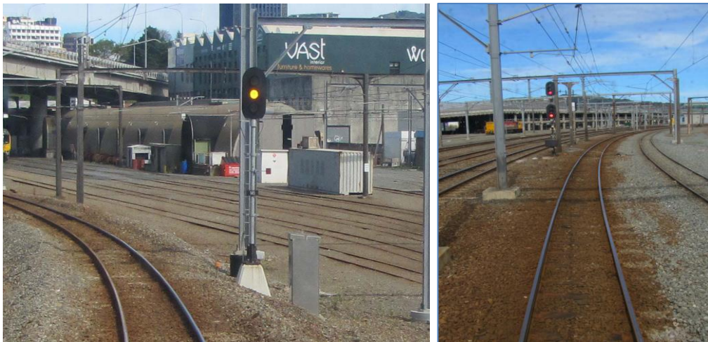
Figure 1 Signal 145 at yellow (left) and Signal 38 at red (right)