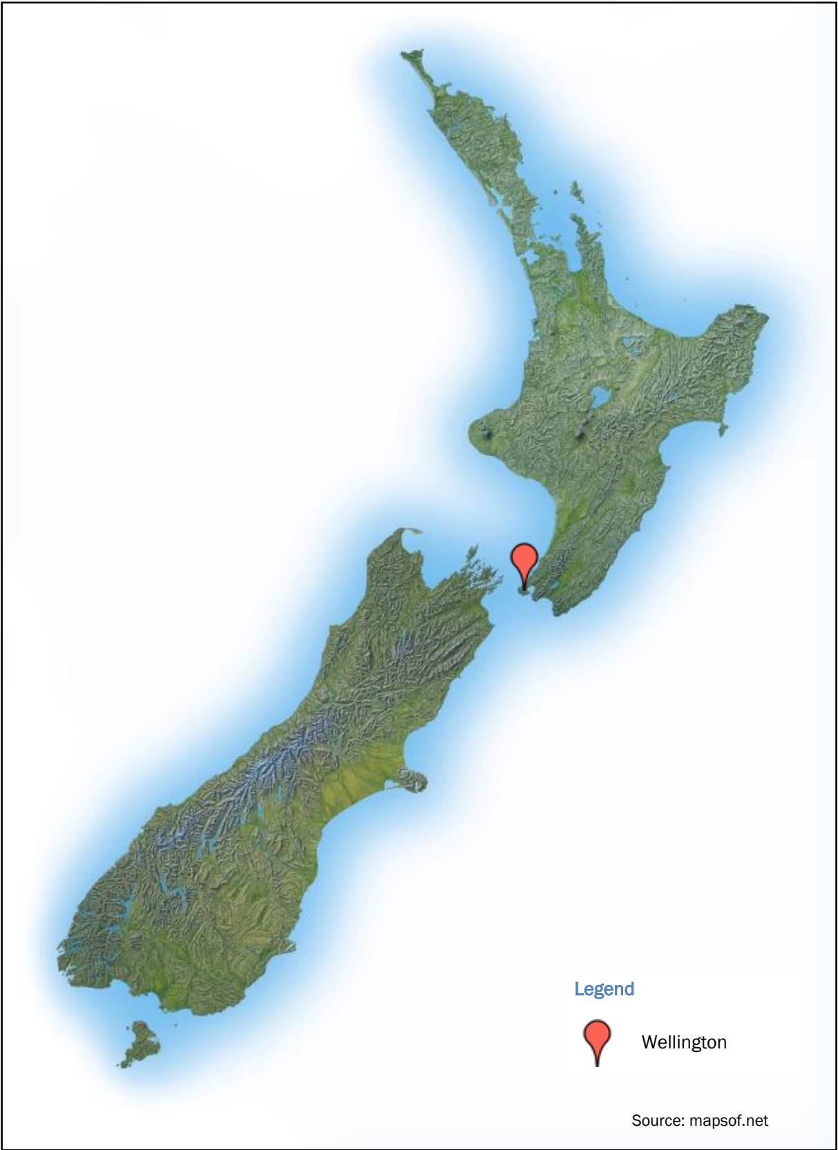
Location of accident