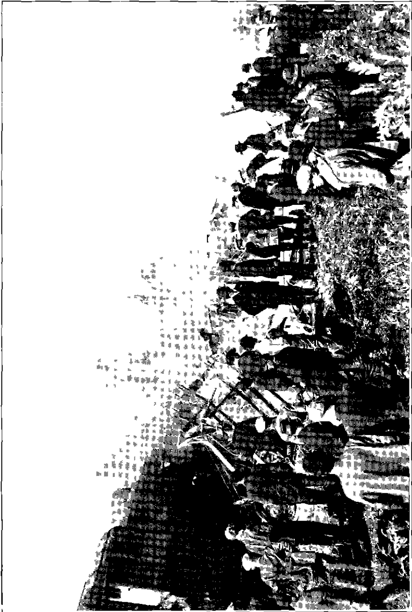
FIG. 4.—VIEW OF LOCOMOTIVE 8485 AND WRECKAGE