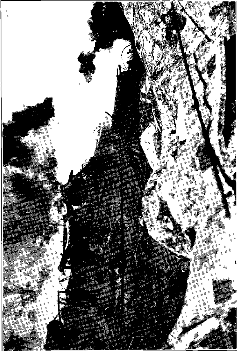
FIG. 3.—CENTRAL VIEW OF BRICKACT FROM THE WEST SHOWING EISEN