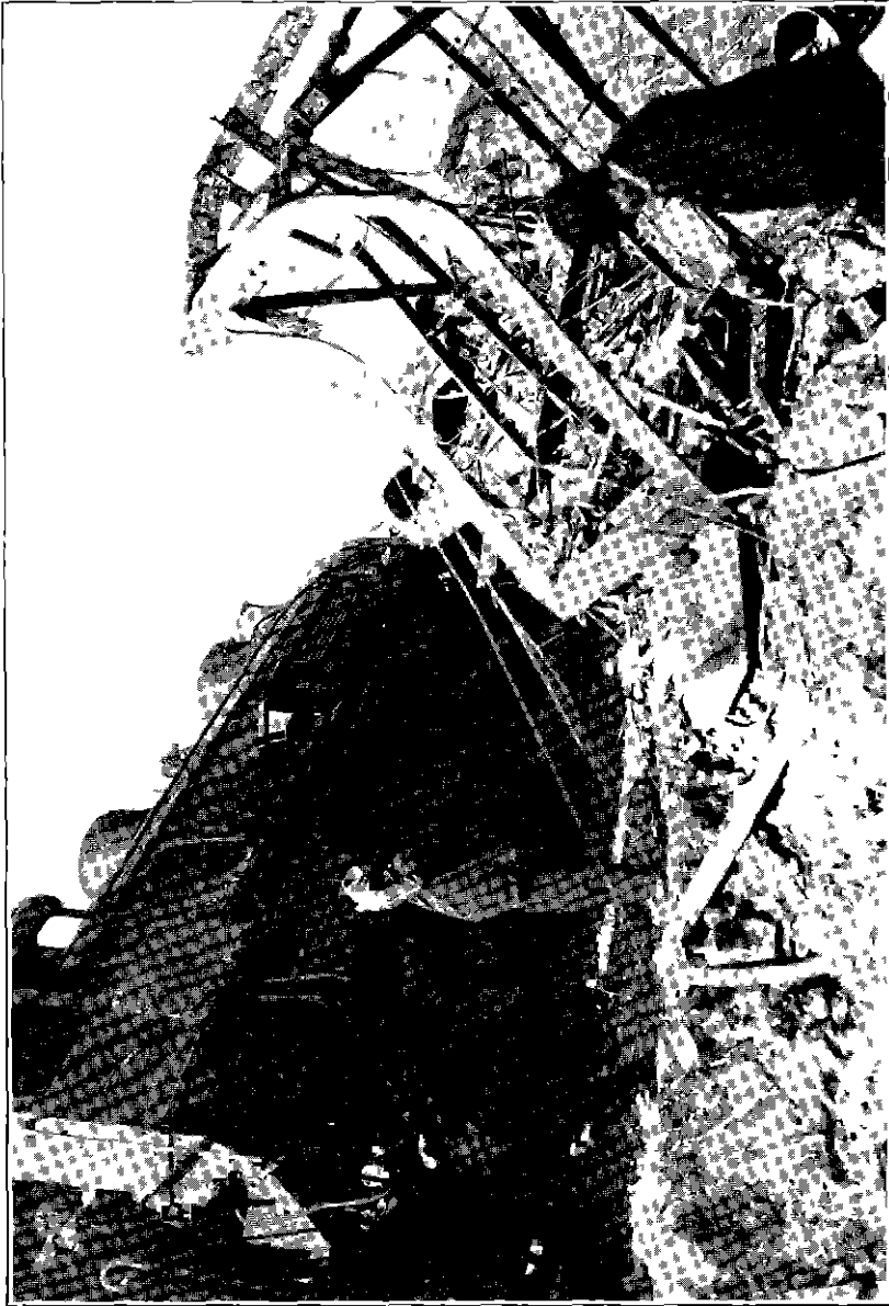
FIG. 5. VIEW OF LOCOMOTIVE 8457. TWENTY BODIES WERE TAKEN FROM UNDER THIS ENGINE.

ADDITIONAL COPIES OF THIS PUBLICATION MAY BE PROCURED FROM THE SUPERINTENDENT OF DOCUMENTS GOVERNMENT PRINTING OFFICE WASHINGTON, D. C. AT 5 CENTS PER COPY