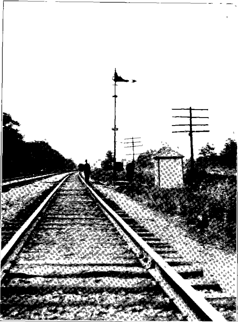
FIG. 2—AUTOMATIC SIGNAL 2781—VIEW TOWARD SCENE OF ACCIDENT