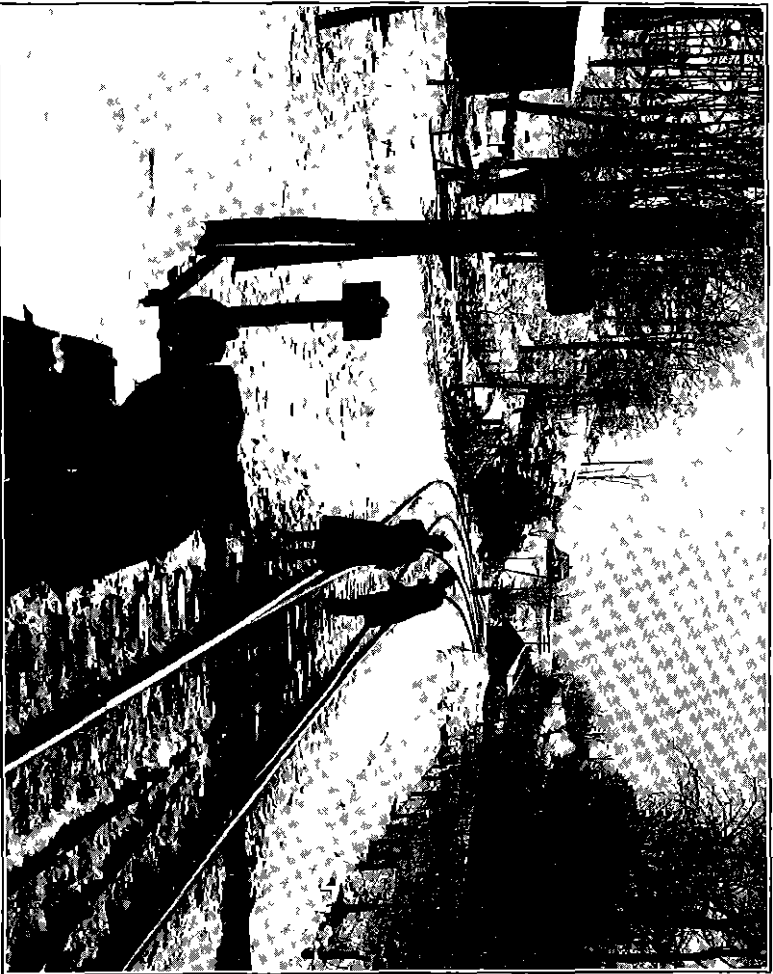
FIG 5—LOOKING WEST TOWARD STATION AT BYRN ATHYN SPUR TRACK ON LEFT