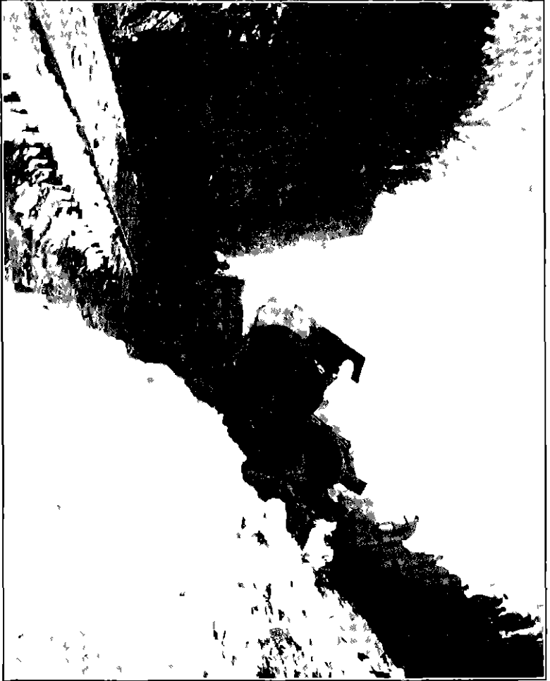
FIG. 1—VIEW SHOWING HOW ENGINES CAME TO REST