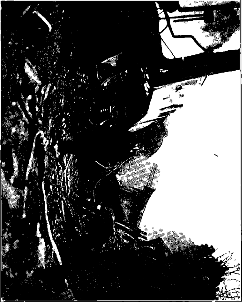
FIG 3—CLOSE UP VIEW OF WRECKAGE IN CUT, BURNED CAR ON LEFT