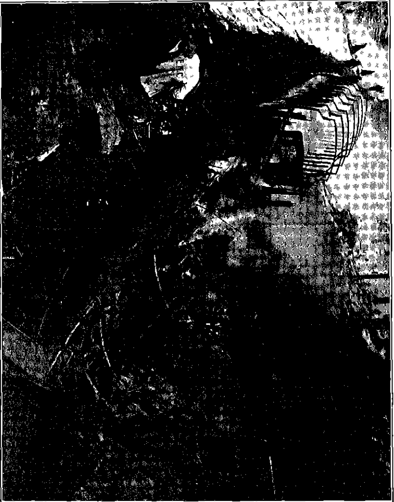
FIG. 2.—LOOKING EAST FROM TOP OF CUT SHOWING BURNING CARS OF TRAIN NO. 156