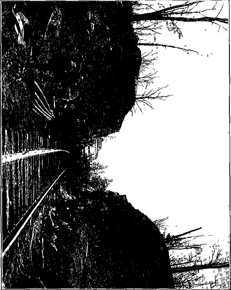
FIG 4—LOOKING EAST TOWARD POINT OF ACCIDENT.