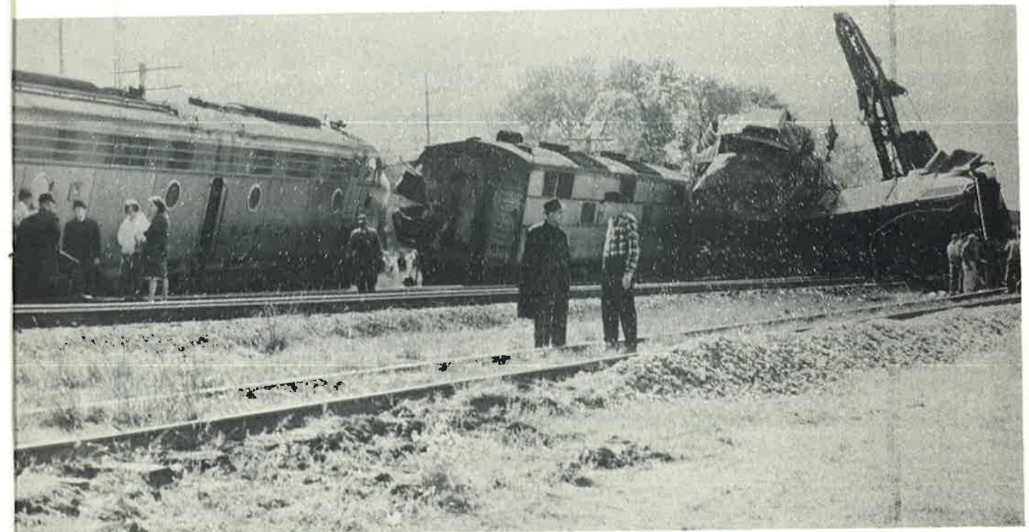
At right, first diesel-electric unit of No. 3 shown overturned with first diesel-electric unit of Extra RI 656 East on top. Second and third locomotive units of No. 3 at left and center.