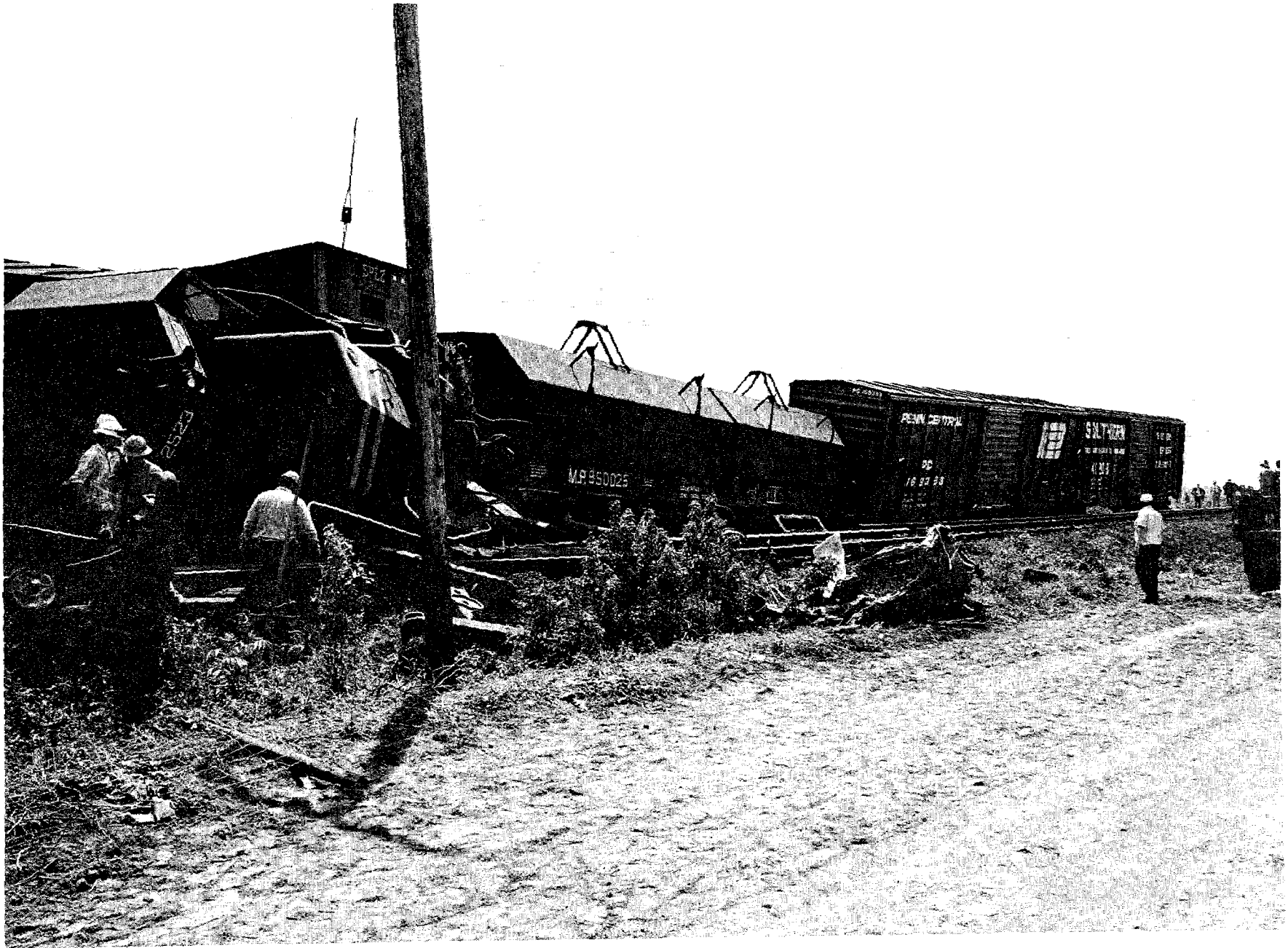
VIEW OF ACCIDENT SITE