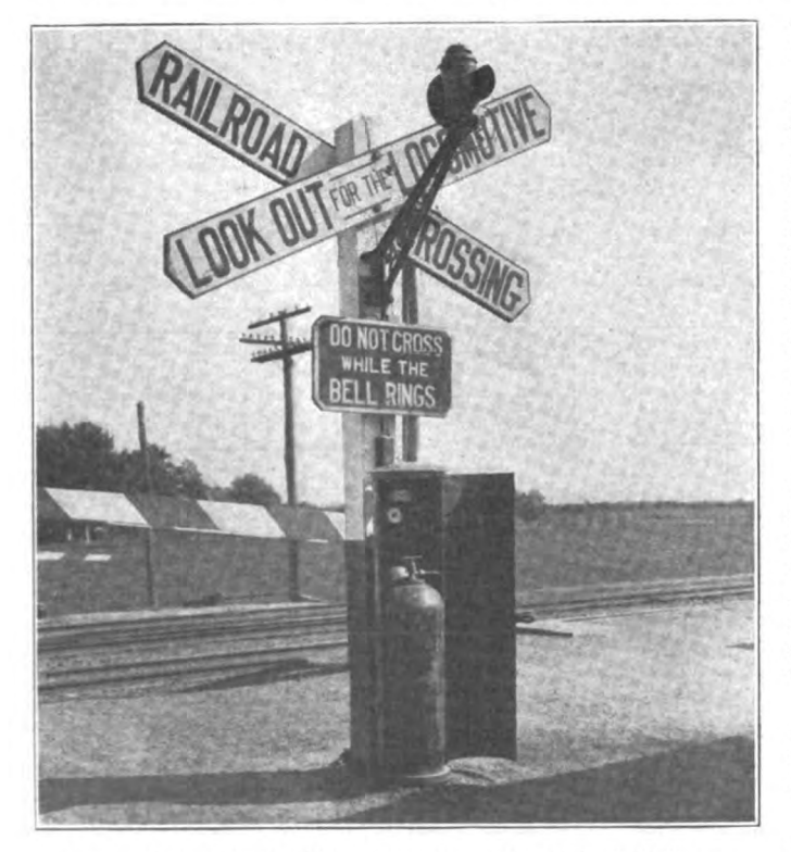
One of the Flash Light Crossing Signal Installations

The close-up view of one of the equipments shows clearly how the arm was bolted to the existing sign post. This arm carries the lamp which stands out 29 in. from and a little above the center of the sign. The acetylene for the light is compressed into the 12 in. by 36 in. seamless steel tank of 225 cu. ft. capacity seen at the bottom