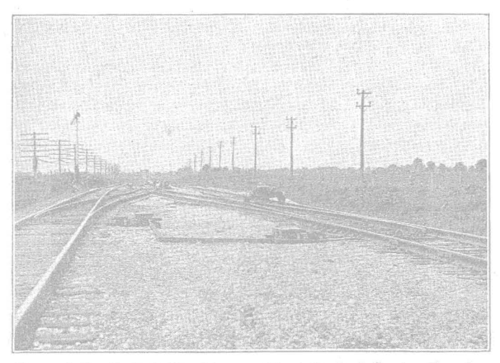
Two of the Switch Machines at East End of Center Passing Track, Mendota, Ill.

At several places on the Burlington, where the switch at the end of double track would otherwise necessitate train stops, this switch, together with the signals protecting the movement of trains, are operated electrically by low-voltage motors and are controlled by levers in nearby stations or towers. For example, at Bridge Switch, Wis., the switch at the end of double track is controlled from the tower at a railroad crossing at Crawford, 11/2 miles away, thereby eliminating the necessity for trains stopping. This line handles four passenger trains and about eight freight trains each way per day. This installation