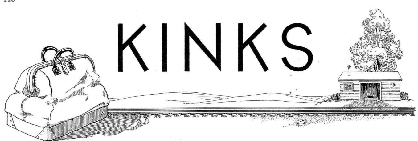
[Contributions published in this department are paid for on a regular basis at a rate of $3 to $10, depending on the usefulness of the idea, the illustrations, and the length of the article.]