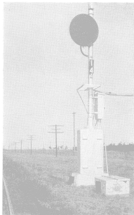
Home signal at automatic interlocking on the Santa Fe

The best protection against this type of trouble on new installations, or, if economically practical on existing installations, would seem to be the installation of what is known as the searchlight type, color-light signal that has been made available through both of the large signal com-