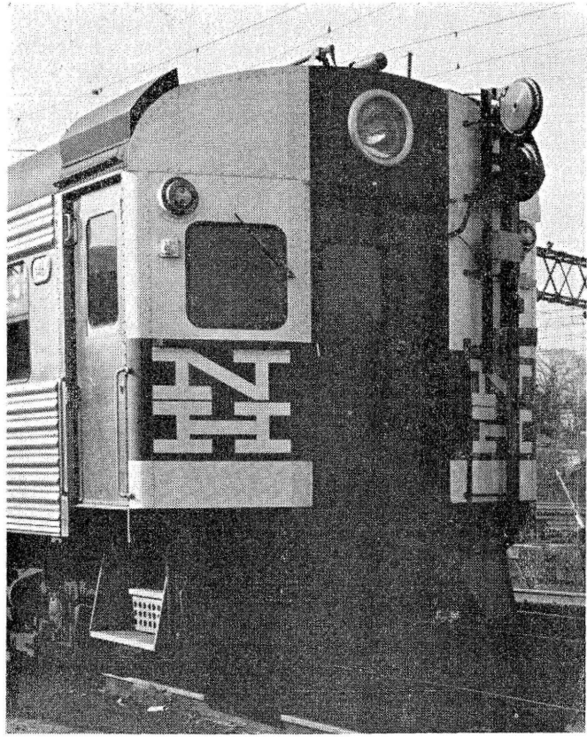
TWO RECEIVING COILS are mounted outside and on the front end of car, shown upper right in this picture